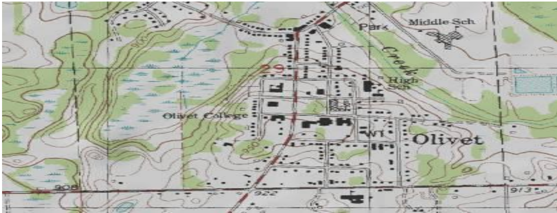
Long / Lat. GPS coordinates of N 42.44198 and W -84.92499 (Maps taken from USGS survey data Michigan / Centered from Olivet campus Quad)

Large campus Liberal Arts College located in the city of Olivet Michigan, the current geographical data shows 41 buildings along with parking listed. The campus itself has both recent build and original structures dating back to and prior to 1844. The buildings within the campus structure serve as fraternities, sororities, study areas, student common areas, and administrative and maintenance facilities. At least one of the original structures was destroyed by fire; several were noted however no documentation was available for this report.